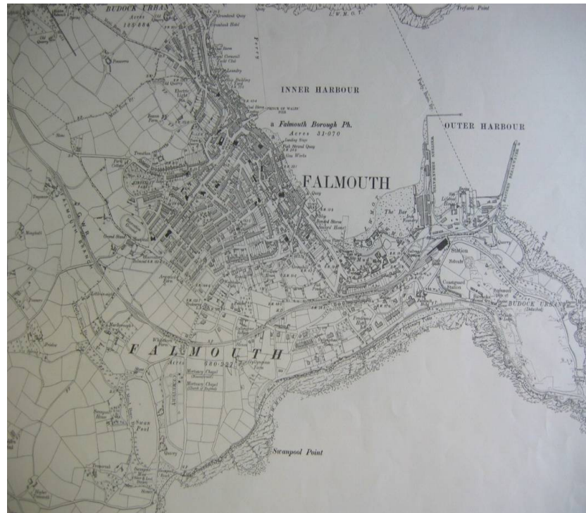
Figure 1: Ordnance Survey Map 1909

In 1912, 358 British and foreign ships left Falmouth, 151 of those to other British ports. In the same year 2,000 coastal ships were received and 2,137 left with cargo or in ballast. Falmouth's fishing fleet of 191 boats, employing about 733 men and boys, operated out of the port which also contained 30 steamers for towage and boarding and seven pilot cutters. The Falmouth Register listed 150 merchant ships. In 1913, the port handled 532,702 tons of foreign cargo and 301,400 tons of cargo of British Possessions; Customs revenue in 1913 was £10,000. 3