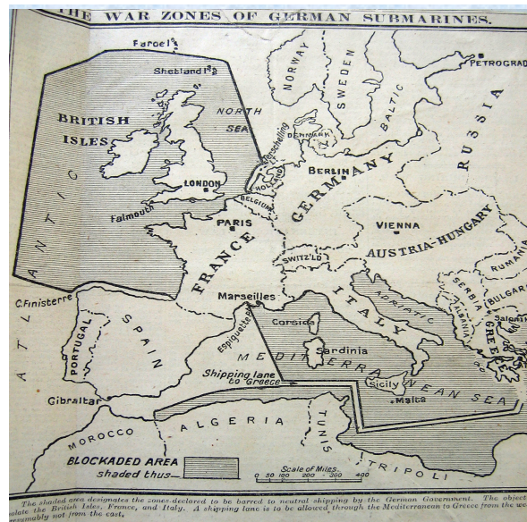
Figure 5: The War Zones of German Submarines