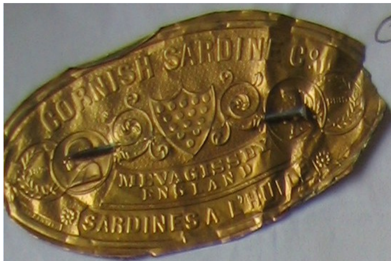
Figure 7: Cornish Sardine Company label

Aug.9 'Triton' returned. Saw German submarines not a mile away pointing guns at them. They did not fire & were left alone but made the Channel Islands on the way home to escape. 'Rebecca S Wade' also returned to Falmouth under sail, leaking and crew refusing to proceed.