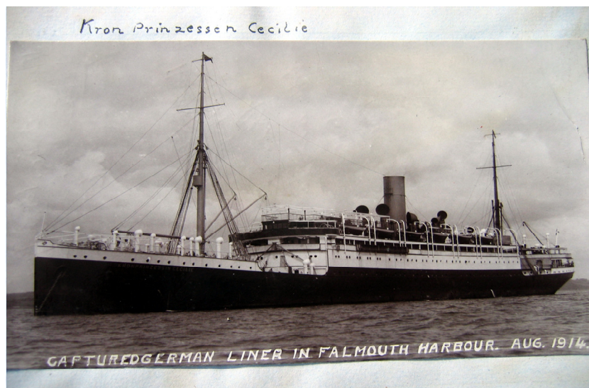
Figure 2: Kronprinzessen Cecilie