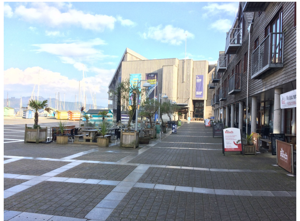
There is a short walk to the museum from the car park