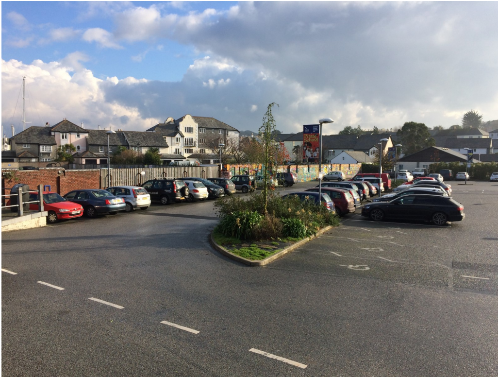
This is the car park.

You can arrive by car, bus, train, boat or ferry. The car park is a short walk from the Museum.