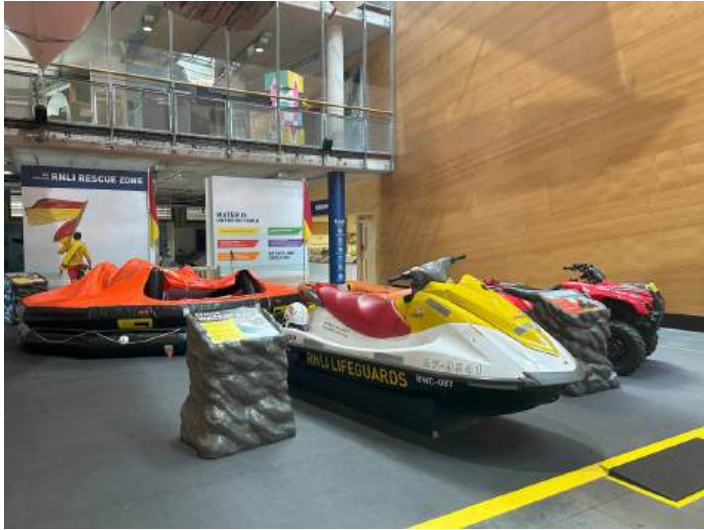
RNLI rescue zone and life rafts