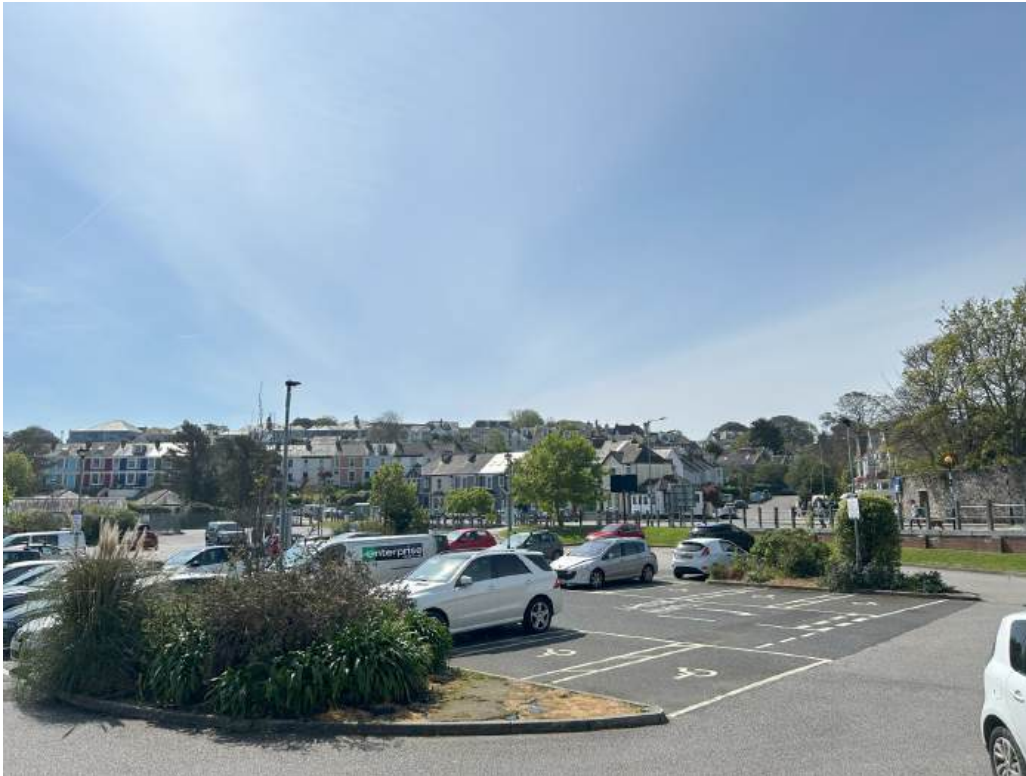
This is the car park.

You can arrive by car, bus, train, boat or ferry. The car park is a short walk from the Museum.