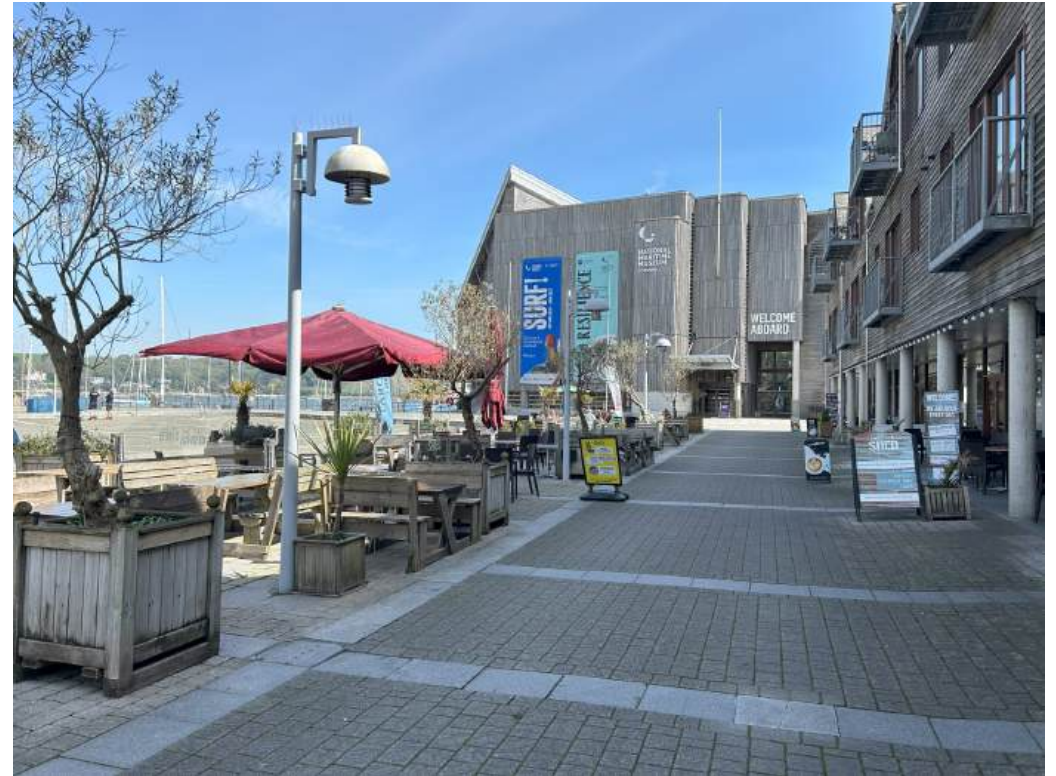
This is the walk to the Museum from the car park.